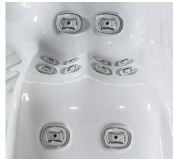
Foot, calf and thigh massage in one reclining seat