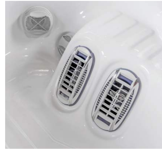
Infinity foot massage